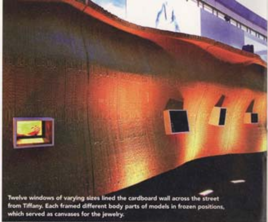
Twelve windows of varying sizes lined the cardboard wall across the street from Tiffany. Each framed different body parts of models in frozen positions, which served as canvases for the jewelry.