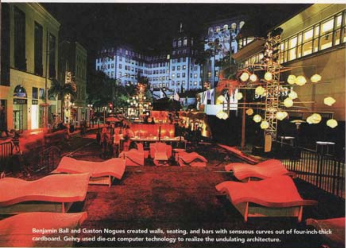
Benjamin Ball and Gaston Nogues created walls, seating, and bars with sensuous curves out of four-inch-thick cardboard. Gehry used die-cut computer technology to realize the undulating architecture.