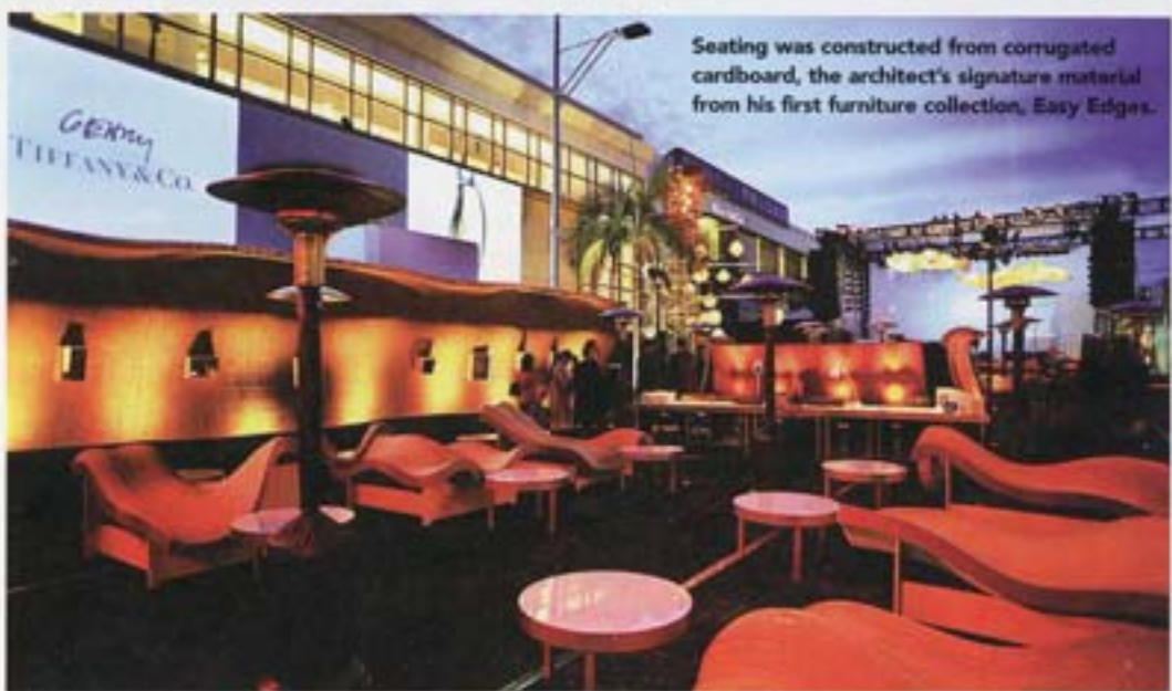
Seating was constructed from corrugated cardboard, the architect's signature material from his first furniture collection, Easy Edges.