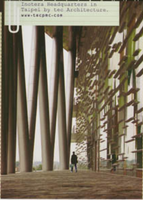
Inotera Headquarters in Taipei by tec Architecture. www.tecpc.com