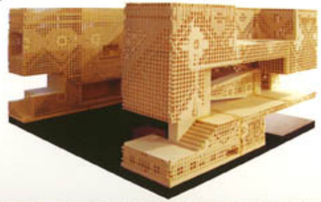
Portuguese house, Moita, by Atelier de Santos Arquitectura, Portugal.