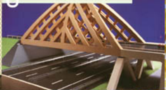
Wooden viaducts over the A7 motorway in Speek by Hans Achterbosch Architects. www.achterboscharchitectuur.nl