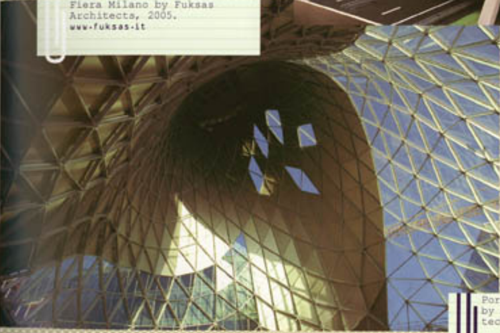
Fiera Milano by Fuksas Architects, 2005. www.fuksas.it