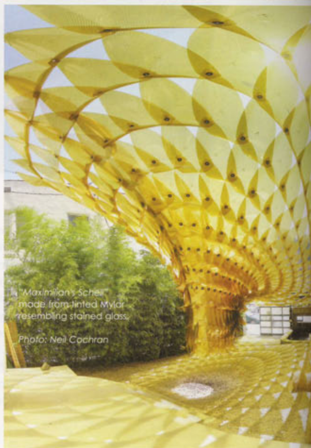
"Maximilian's Schell" made from tinted Mylar resembling stained glass.

The Los Angeles based Ball-Nogues Studio is a fantastic example of how simple objects when put together can turn into an artistic event. The masterminds behind the dreamy installations, which without a doubt "enhanced" the spaces they were designed for, are Benjamin Ball and Gaston Nogues. Compositions like the "Maximilian's Schell" at the Materials & Applications exhibition in Los Angeles, USA created from tinted Mylar that resembled stained glass and one of their latest "Gravity's Loom" composed from an array of vibrantly coloured strings generating a soft spiralling and translucent surface, are a few of their widely popular installations.