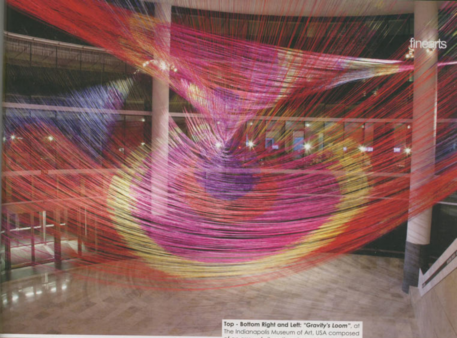
Top - Bottom Right and Left: "Gravity's Loom", at The Indianapolis Museum of Art, USA composed of an array of vibrantly coloured hanging strings spanning the entire pavilion.