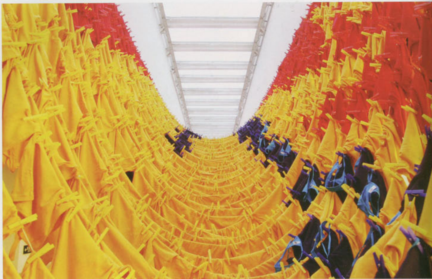
Top - Bottom Right - Following Page: "Built to Wear", designed for the Shenzhen Hong Kong Biennale of Urbanism invoking the theme of the exhibition "City Mobilization".