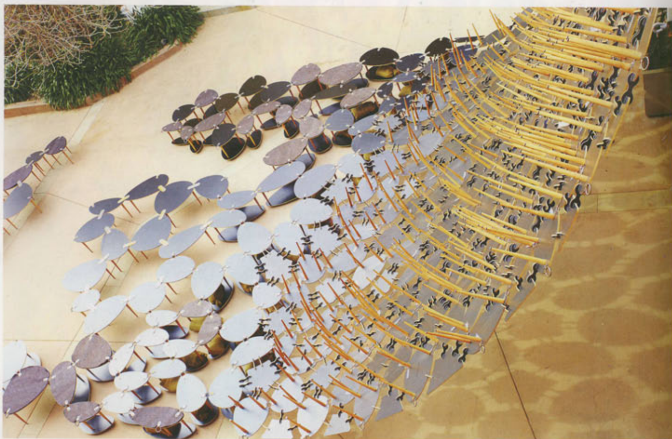
Top - Bottom Right - Following Page: "Table Cloth" is a new performance space in the courtyard of Schoenberg Hall at the UCLA Herb Alpert School of Music in Los Angeles, USA.